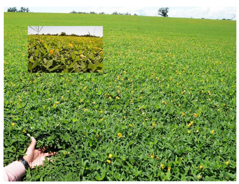
Figure 2. Established Field of Perennial Peanut in the Florida Panhandle.

Production patterns of perennial peanut suggest that two cutting per year might be feasible with an eight-week growth or three cuttings can be obtained with five to six-week growth, respectively. No cutting is recommended at least 5 to 6 weeks before a killing frost. Yield potential ranges from 3 to 5 tons/ acre in a well-established stand and with favorable climatic conditions (Fig.2). Perennial peanut can be grazed or feed to a wide range of livestock animals (horses, dairy and beef cows, goats and sheep), but caution should be taken when feeding it to horses. Because of the high nutritive value, mature horses tend to gain excessive weight when feeding a full diet based on perennial peanut. It can be fed as hay, silage or green chop and could be an ideal substitute for alfalfa. When used as silage, perennial peanut can be substituted for up to 70% of corn silage while maintaining milk production and it could be more profitable than corn diets when substituted for up to 50% of the diet. The protein and digestibil-