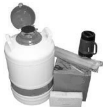
Practical AI equipment training and semen handling techniques are part of the MSU AI School program