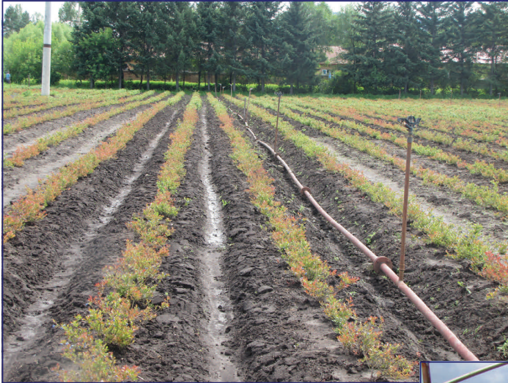
Photo 4: Half-high blueberry planting in Yuchen Province, North China.