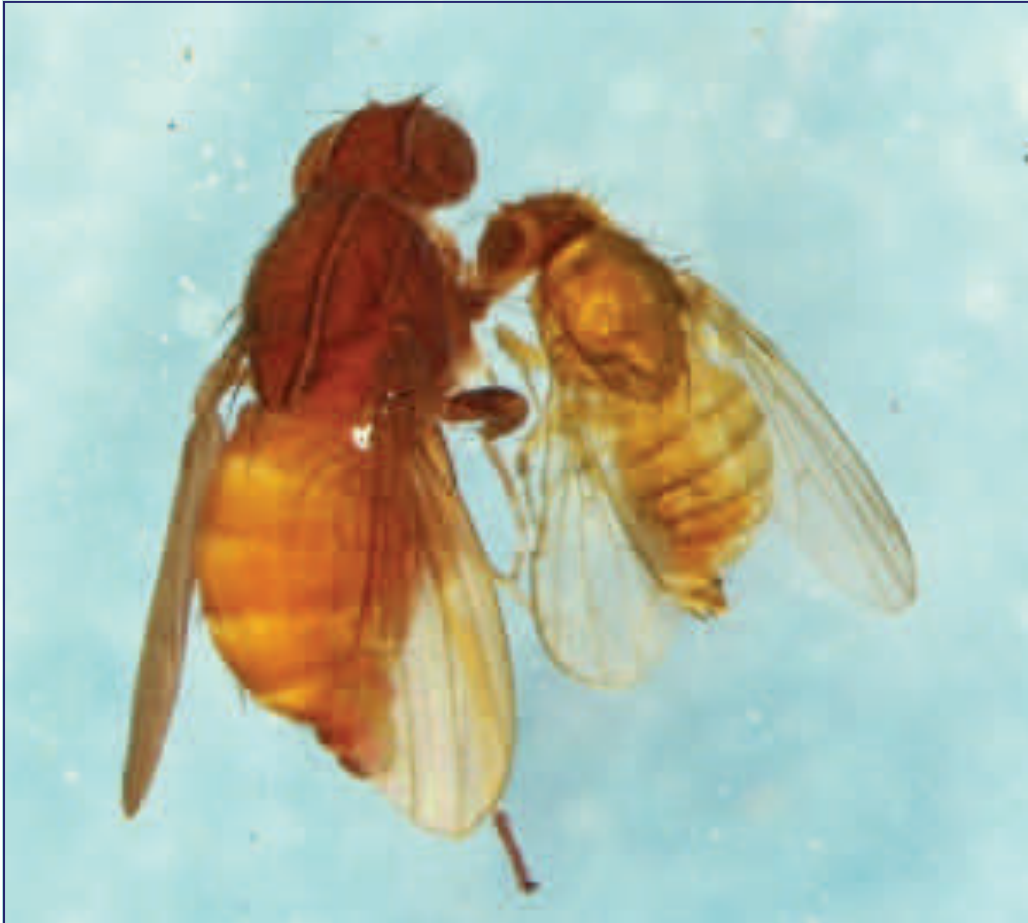
African Fig Fly (left) and SWD (right). Note larger size and defined stripes on the AFF.