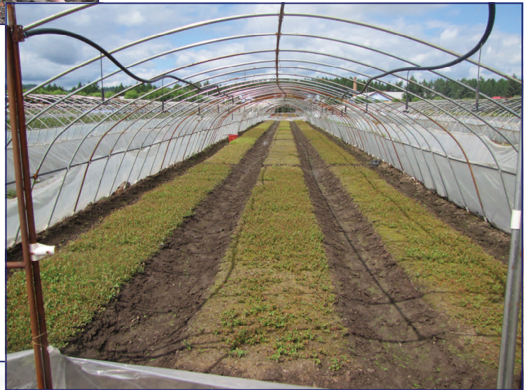
Photo 5: Nursery in North China with over 2 million blueberry plants.